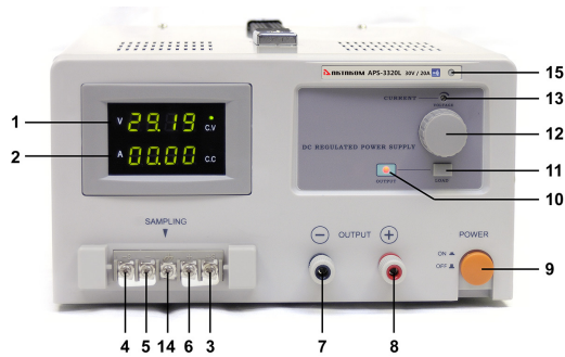
Fig. 1. Front panel controls