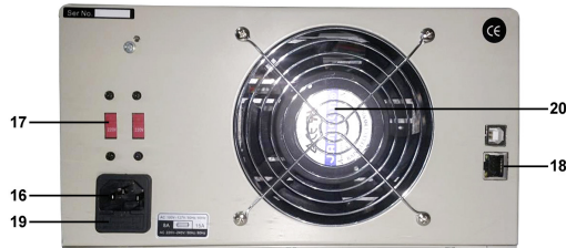
Fig. 2. Rear panel