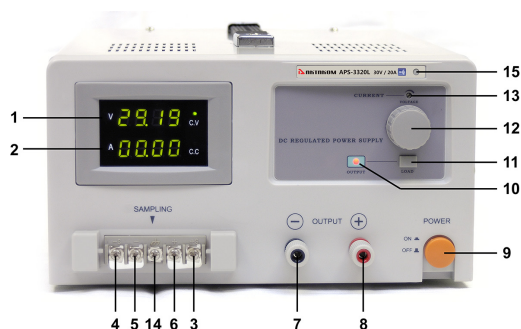
Fig.1. Front panel controls