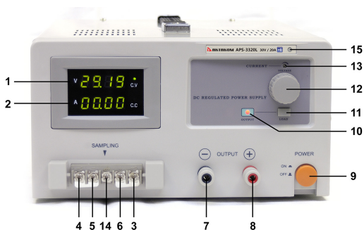
Fig. 1. Front panel controls