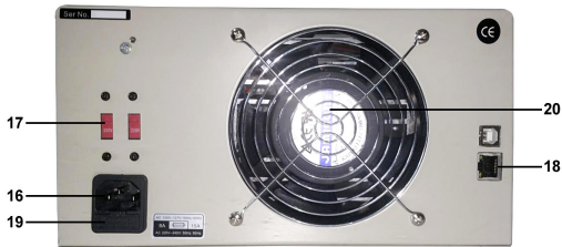
Fig. 2. Rear panel