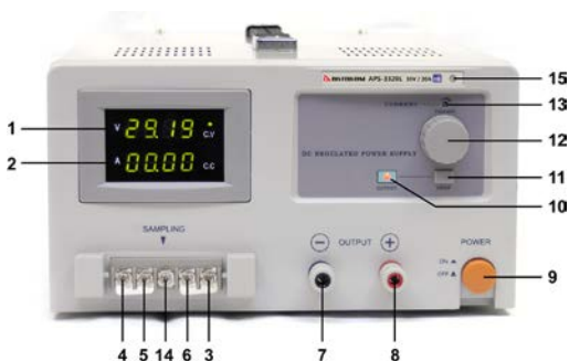
Fig. 1. Front panel controls