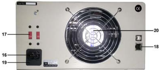
Fig. 2. Rear panel